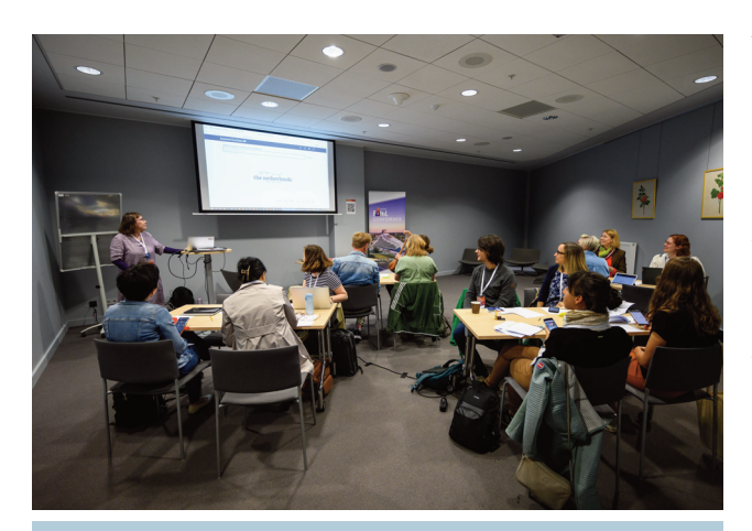
Fig. 9. One of the workshops on 13 June 2024

Most glorious and intricate venue (The House of the Black Heads) we kept for the high point of the conference – Gala dinner. Luxurious Celebration Hall was a stunning background to have dinner and listen to modern jazz band Lupa. The evening was wrapped up by visiting the "First Latvian Rock Cafe", to dance till the morning comes.