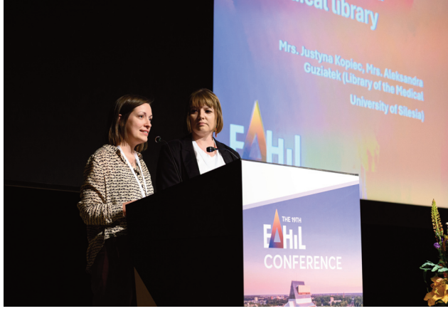
Fig. 2. Best poster prize winners at Poster Presentation Rapid-fire session

Venue. National Library of Latvia was always a number one choice as to a venue for main events of the conference, because it stands as a central hub for libraries, knowledge, and culture. This iconic location was selected not only for its architectural significance but also for its role in embodying the values and mission of the conference, making it the perfect setting for discussions on how libraries can adapt and thrive in a rapidly changing environment.