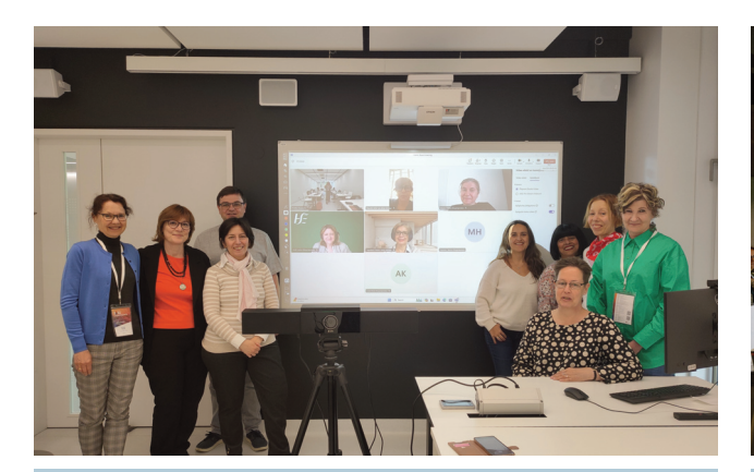
Fig. 3. EAHIL Executive Board Meeting.

EAHIL Board meeting and continuing education courses were organised in the newest RSU building – Pharmaceutical Education and Research Centre. It was opened in March 2023, and it doesn't just house the Department of Pharmaceutical Chemistry, the Department of Pharmacology, and the Department of Applied Pharmacy and the Laboratory of Finished Dosage Forms, but also has plenty of rooms for seminars and meetings with visitors from abroad.