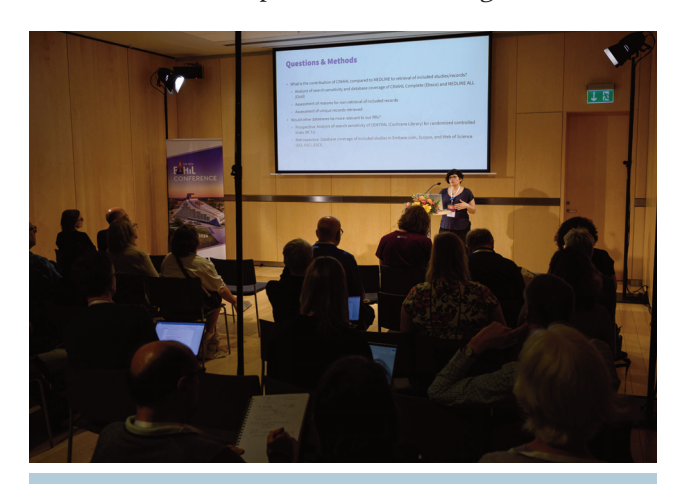
Fig. 1. One of the oral presentation sessions on 13 June 2024.

91 abstracts went through to our conference programme – 49 oral presentations, 17 poster presentations, 20 interactive workshops and 5 continuing education courses.