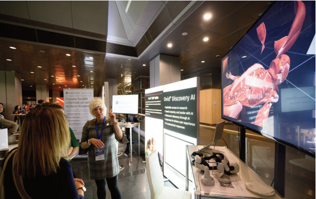
Fig. 4. Platinum sponsor Wolters Kluwer stand at sponsor exhibition

Sponsor attraction. After putting up EAHIL 2024 Sponsorship Prospectus and updating some of the previous year's sponsor list contact information, a lengthy and thorough process of communication with potential sponsors began. It was slow in the beginning, and we got scared a bit. But timing of the financial planning of next year's budget made sense and, in the end, we did receive enough positive answers from 4 sponsors (Wolters Kluwer, EBSCO, Elsevier and Amboss), 18 exhibitors (Thieme Group, S. Karger AG, Springer Nature, Sage Publications Ltd, Covidence, The Cochrane Collaboration, Technology from Sage, Clarivate, Accucoms, BMJ, TDNet, MA Healthcare, Oxford University Press, JAMA, MDPI, CABI, Taylor & Francis and Bentham Science) and one walk-in agent (OCLC).