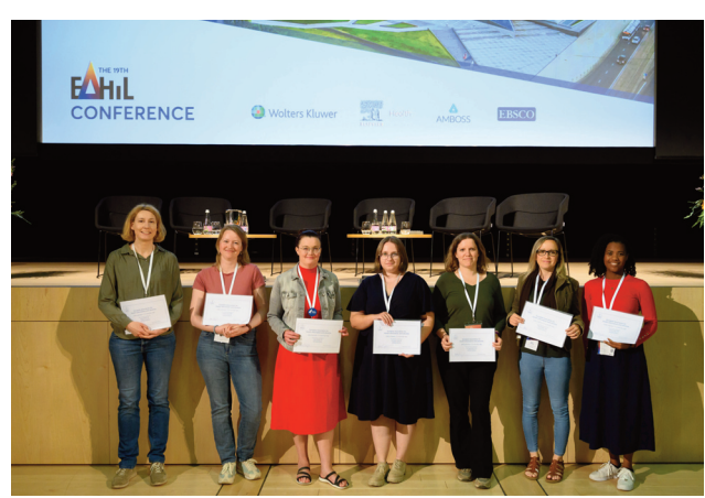
Fig. 13. EAHIL Scholarship winners at the closing ceremony

On Friday afternoon our cheeks were hurting after hours of endless smiles on our faces – everyone who was leaving the venue to travel home or experience a bit more of Riga showered us with compliments and words of gratitude. It helped us realise (much sooner than we originally thought we would) – it was all worth it.