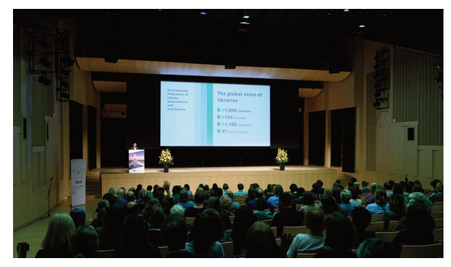
Fig. 6. Conference participants listening to opening keynote speech