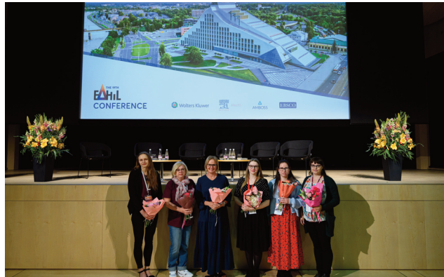
Fig. 15. Part of LOC and volunteer team at the closing ceremony

the rest of us to feel a bit like fish out of the water. Couple of notes to us and future EAHIL event organisers – get more people in the LOC (even though it seems, that we were the only ones, who had team this small), have someone outside the team go through conference website and tell, if everything is clear there and nothing is missing, try setting up more than one payment method (preferably both – bank transfer and card payment), even if one of them will appear later during registration period, don't be afraid to ask catering to include more/better options for different dietary needs, don't be disheartened by low activity from potential sponsors – they will apply, they just need time to sort out their budgets.