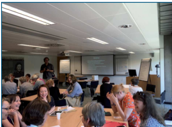
Figure 1. Participants at the workshop session on the Delphi technique

First, I have to admit that the workshop session was really fun. The workshop variant of a Delphi study is also called mini-Delphi. If you want to carry it out seriously, more time is needed. I think with about 2 hours you can play through each stage correctly, 3 hours would be more appropriate. We proceeded as follows: first, we introduced the method, as used in the Horizon Report. Then we carried out the various stages with about 25 participants ( Figure 1 ).