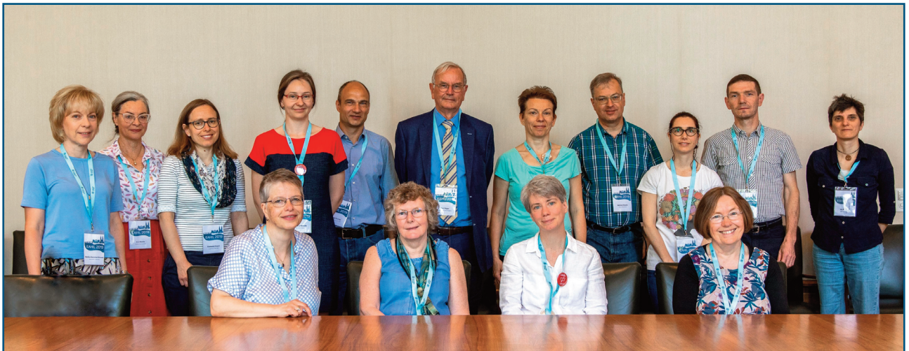
EAHIL TrEDMIL meeting, Basel, 2019 - the last time that TrEDMIL was able to meet in person.