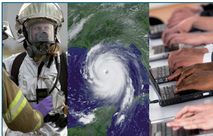
Disaster Image Collage

The Disaster Information Management Research Center (DIMRC) , a part of the Specialized Information Services Division helps prepare for, respond to, recover from, and mitigate the adverse health effects of disasters. The DIMRC site hosts a variety of tools and information resources including, Emergency Response and Toxicology Tools and Apps, Subject Guides, and Disaster Medicine and Public Health Literature.