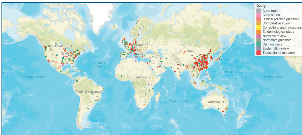
Fig. 2. A screenshot of the interactive geographical map built using EviAtlas (8).

sources such as the WHO database (Figure 2). We named this endeavor the meta-evidence project. The interactive geographic map was powered by EviAtlas, an open access platform for visualizing synthesis data (8). In particular, at the time we were building the map, the literature being captured by the bot was primarily in English and limited to geographies with users present on Twitter. Thus, there were significant gaps in coverage, particularly research emerging from China, who at that stage, had more lived experience of the virus and disease than the rest of the world. Dr Howard White, CEO of the Campbell Collaboration collaborated with Professor Kehu Yang, Director of Lanzhou University's Evidence Based Medicine Centre in China to compile and translate evidence from sources in Chinese to expand the map's coverage. This work was made possible given the generous pro bono effort from Professor Yang and a team of seven researchers.