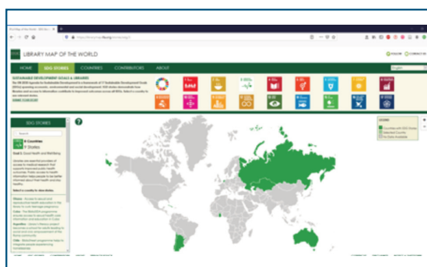
Fig.2. IFLA library map of the world with nine examples about SDG 3 "Health and Wellbeing" (04.11.2020).

Medical and health libraries have a huge trove of special knowledge. SDG 3 "Health and Wellbeing" belongs to the most important of the SDGs and is crosslinked with many other SDGs, such as access to sanitation (SDG 6) or ending hunger (SDG 2). On the IFLA library map of the world (5), there are 9 stories concerning SDG 3 (Figure 2). They are all about public libraries giving access to health information. As public libraries are closer to the public, it makes sense that they are the primary institutions to spread quality knowledge. But medical and health libraries could provide public libraries with quality information. This may be a very high aim. But a closer look at the current corona crisis shows, how much health and medical libraries can contribute, or already do. For example, the World Health Organization Library and Digital Information Networks (6) publishes several documents concerning the COVID-19 Pandemic, some of them especially designed for the general public. Librarians, also the ones working in special libraries, are usually aware of public libraries around. As, in my experience, researchers tend to forget their own faculty library, they probably are even less likely to consider public libraries