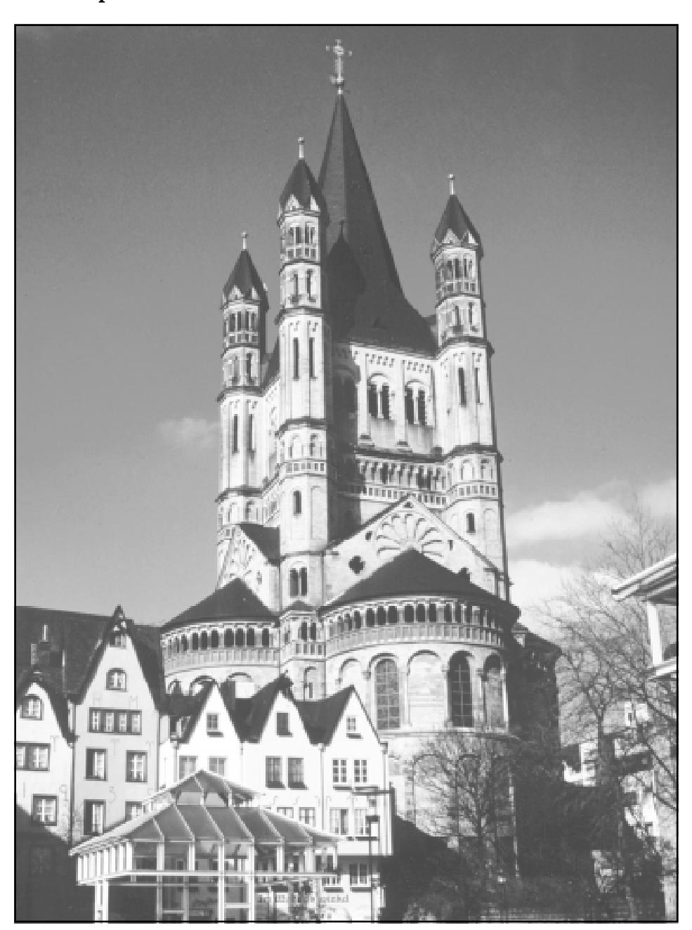
Groß St. Martin

Die Romanische Kirche überragt die Altstadt. The Roman Church in the Old City of Cologne.