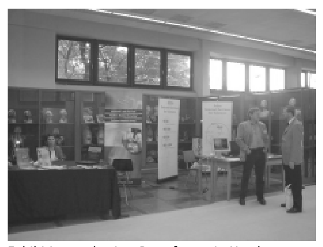
Exhibition at the AgmB confernce in Hamburg

This year the Annual Conference of the Medical Libraries Association (AGMB) was held at the University Hospital, Hamburg-Eppendorf on 17 -19 September. It was organised by the University's Central Medical Library. The main theme of the conference was "Medical Libraries: Actively Changing". It was attended by 170 delegates, from Germany, Italy, the Netherlands, Austria and Switzerland. In parallel with a specialist exhibition in which 25 companies took part, the visitors were offered an extensive and profession-oriented programme of lectures in plenary sessions, working groups and company presentations.