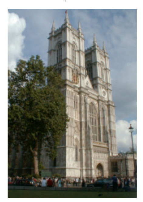
Westminster Abbey, just opposite the QE-II Conference Centre (Suzanne Bakker, NL)

It seems that electronic journals together with other various forms of electronic delivery of documents and other services based on machine-readable literature have led to a qualitative transformation in the access to the resources, which is independent from the distance between a user and the library.