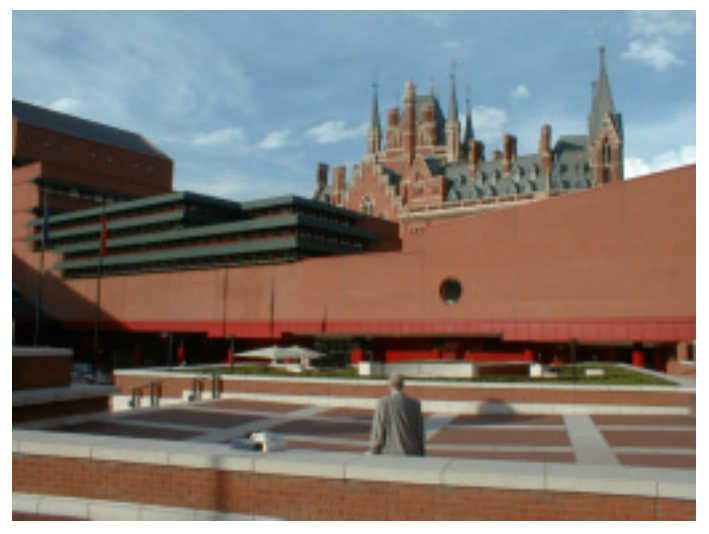
The British Library and St Pancras Station

Central Medical Library, UMF, Iasi, Romania