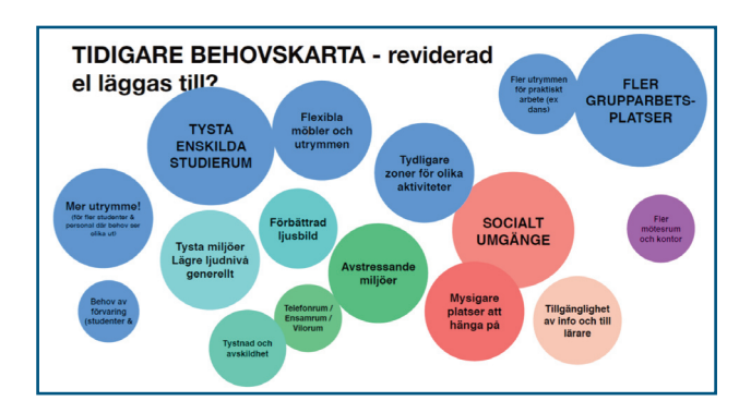
Fig. 2. First needs map. Darker blue: individual silent study rooms; more space; storage needs; flexible furniture and space; zones for different activities; space for physical movement; more group study space. Light blue: silent areas, in general lower volume; improved lightning. Green: relaxing areas; phone rooms/single rooms/rooms for resting; silence and solitude. Red: social space; more cosy space; more accessible information and teachers. Purple: more meeting rooms and offices.

The final report reveals a student that is perhaps different from students in common, in that their studies daily integrates physical and theoretical studies/activities, giving rise to special needs when it comes to study space. They are also focusing on their physical appearance and on their bodies, as well as exercising and practicing movement in all kinds of places, including the library. They are also quite loud, which, together with the bad acoustics in some parts