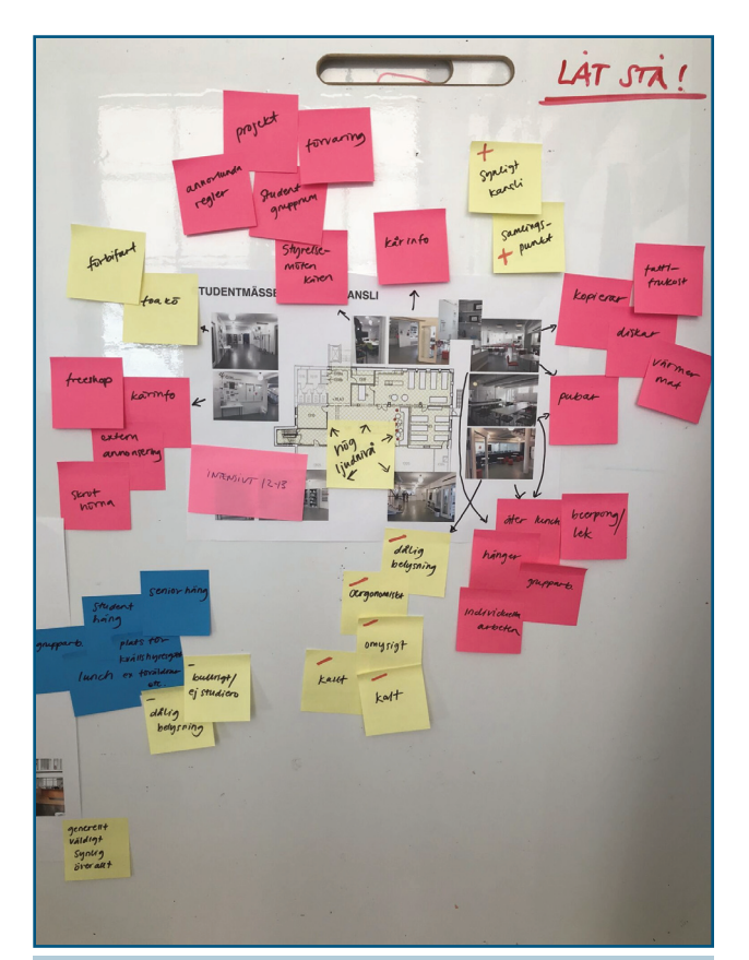
Fig. 1. Example from workshop 1. Plan and photos from student canteen floor, with sticky notes commenting on limitations and challenges, and what works well. Some of the comments: noisy; always very visible; cold; not very cosy; intensive period 12noon-1pm; eating lunch; relaxing; copying; doing dishes; bad lightning.