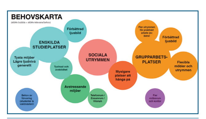
Fig. 3. Revised needs map, from final report. Dark blue: Need for storage (students and caretakers). Light blue: individual study space; silent space, lower volume in general; improved lightning. Green: relaxing space; silence and solitude; phone rooms//single rooms/rooms for resting. Orange: Social spaces; cosy spaces. Yellow: Groups study space; flexible furniture and space; improved lightning; more space for physical movement. Purple: more meeting rooms and offices.

of the buildings, causes difficulties to focus and to find quiet spaces for individual study or relaxation. Social interaction is an important part of their day, and they experience a lack of cosy and comfortable spaces for chatting with other students.