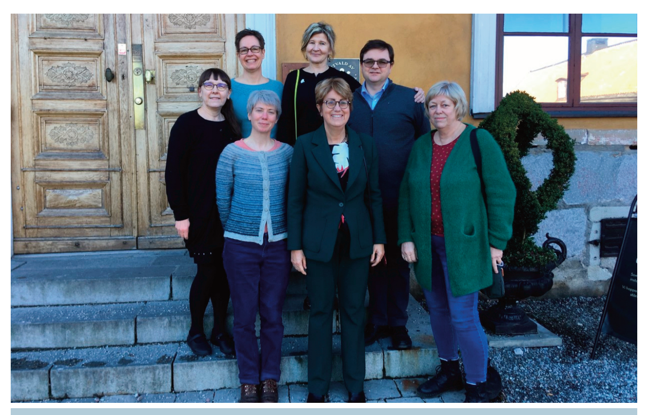
Fig. 2. The Executive Board at the meeting in Stockholm, 5-6 March 2020.