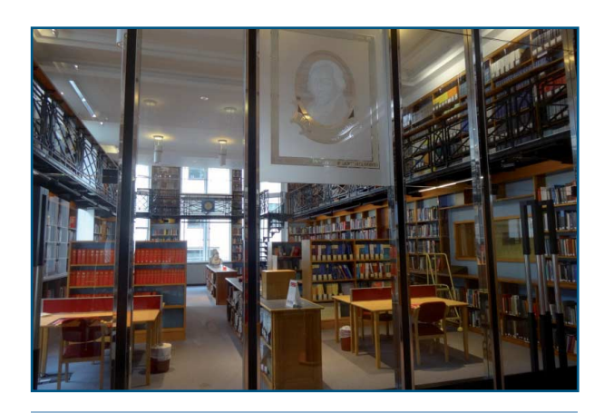
Figure 4. Beautiful silent study reading room at the RSM Library.

Afterwards we visited the very impressive premises of the Royal Society of Medicine Library, where we could also collect information about their literature search services ( Figure 4 ).