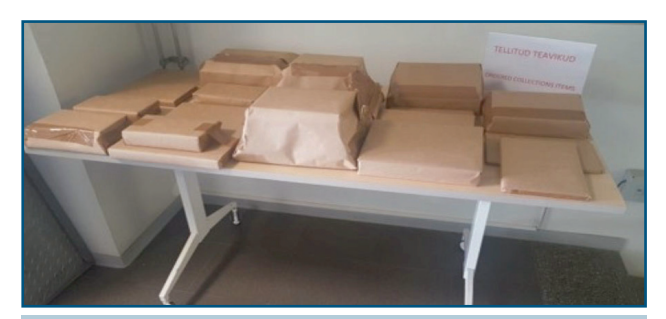
Fig. 1. The table of ordered items.