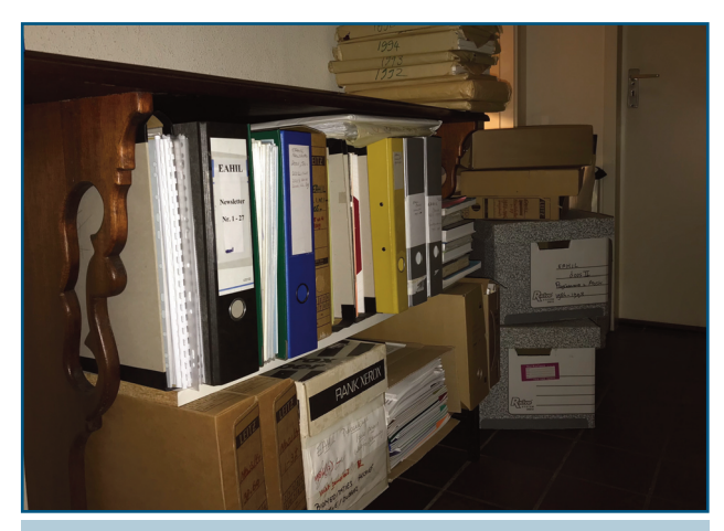
Fig. 1. EAHIL archives waiting to be sorted out and scanned in Abcoude.

Steps taken: (i) at first checking the contents of these boxes; (ii) sorting by kind of material; (iii) deduplicating the newsletter and journal issues; (iv) sorting and deduplication of minutes of Board, Council and GA-meetings; (v) sorting and weeding the correspondence by the secretariat and the presidency over the years.