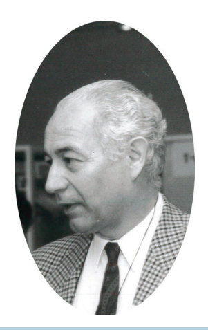
Fig. 5. Marc Walckiers, first President of EAHIL.