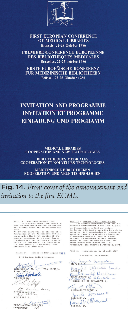
Fig. 15. Signatures of the colleagues accepting EAHIL statutes during the meeting founding the association in Brighton, October 1987.

libraries in Belgium and neighbouring countries, are proposed for the days preceding the conference ( Figure 14 ).