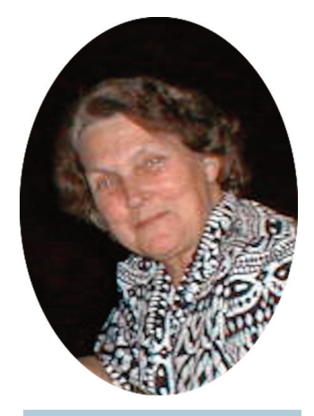
Fig. 6. Ursula Hausen, first vice-President of EAHIL.