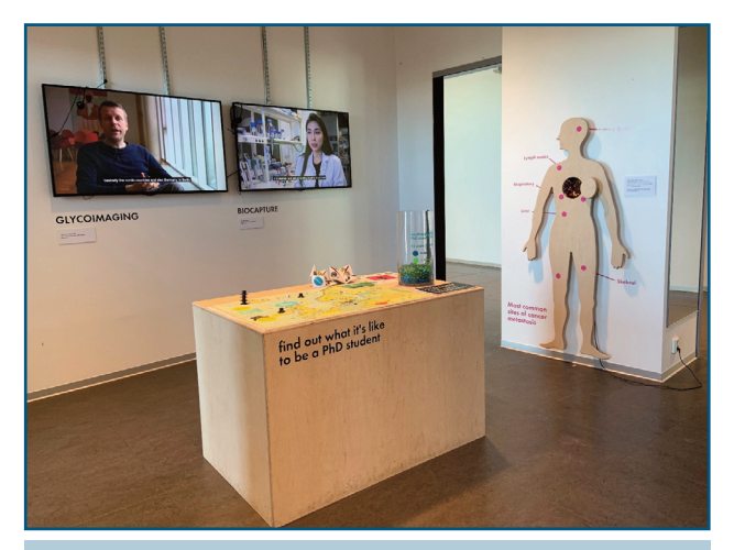
Fig. 1. From the exhibition "Fighting cancer with plastic bullets" 2020. At Malmö University chemists, physicists and biologists from two international networks, BioCapture and GlycoImaging, collaborate to find ways to diagnose and treat cancer at an early stage.

Through the Researchers' Gallery we have obtained an overview of the university's research and created a platform that has generated continued collaboration between researchers and between researchers and librarians. This has led to collaboration between librarians and other actors both inside and outside the university and our expertise is requested for in new contexts. One researcher described the collaboration with librarians like this: "Participating in this work does not take time from my research, it enriches it". Working with exhibitions does take some time for us librarians, but the broader competences we have acquired