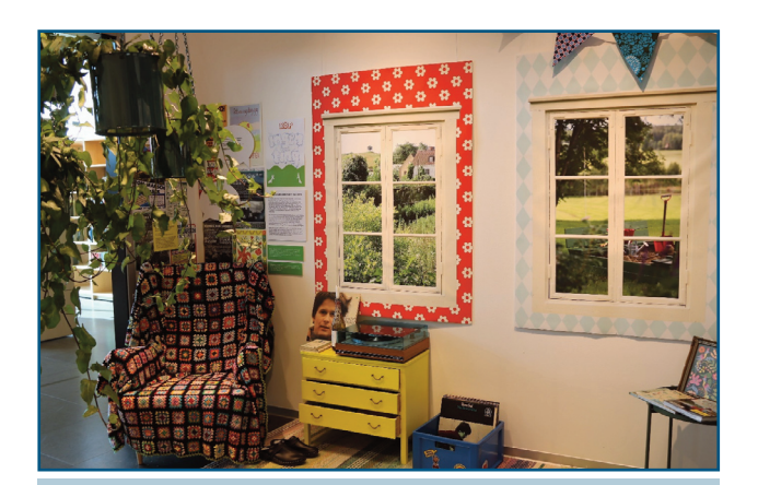
Fig. 3. From the exhibition "Green waves and red cottages" 2019. This exhibition places the concept "idyll" into a context of Swedish literary history and popular culture by highlighting work from different periods. Visualizing the songwriter Bernt Staf.

meeting, and has become a positive addition to the library.