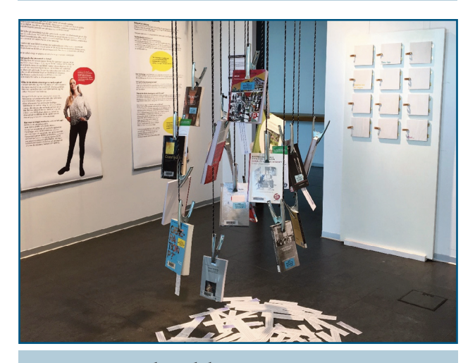
Fig. 2. From the exhibition "6 on sex" 2017. Six researchers, linked to the Center for Sexology and Sexual Studies, presented their fields of research. The exhibition also included a timeline with highlights from Swedish sexuality history, a curiosity cabinet and a collection of erotic literature.

through this work have built relationships and made our role visible at the university in a way that enriches our professional transcendental role.