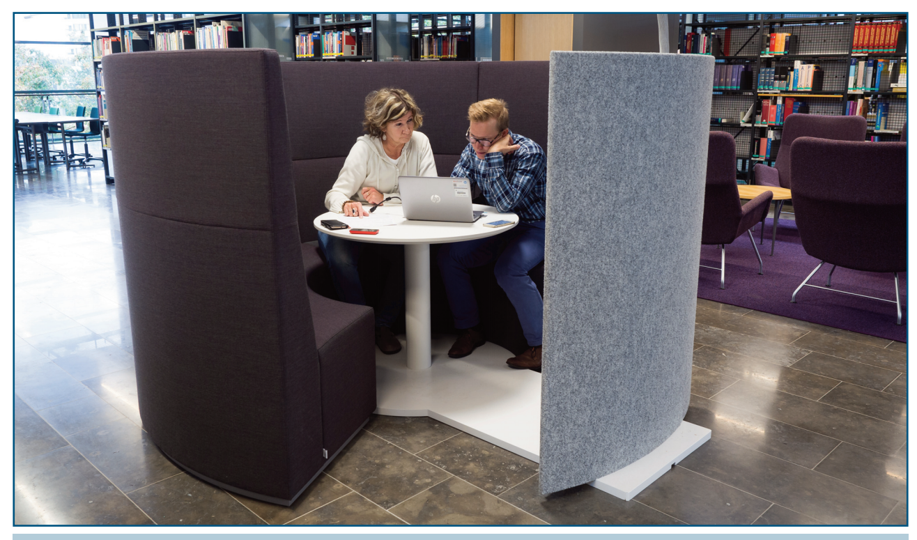
Fig.5. Students would need spaces for both reading in silence and for group working and rooms for collegial meetings.

who use library premises the most. We want to promote research, cooperation and learning. In addition to the learning materials, the libraries offer a safe and communal place to work.