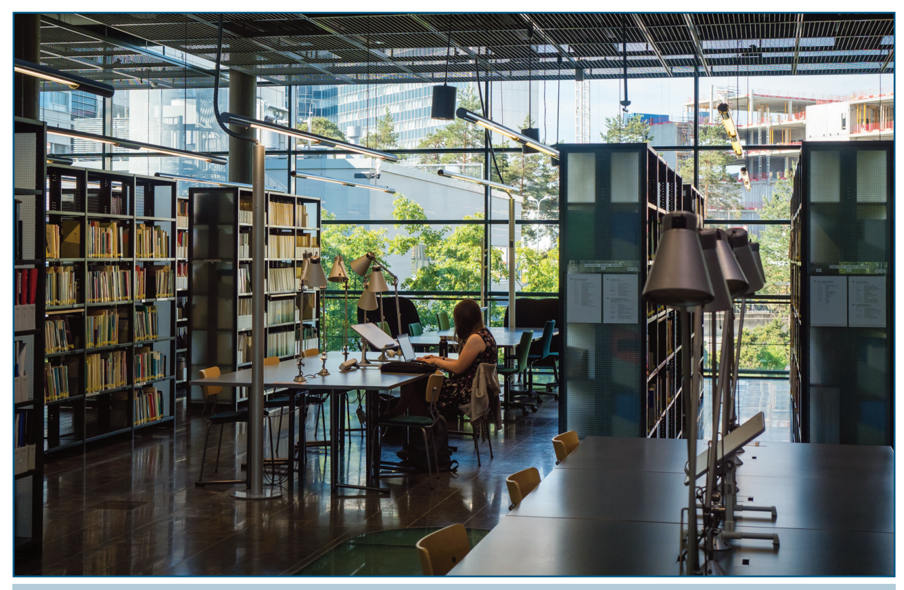
Fig.3. Terkko Health Hub and Meilahti Campus library are located in the heart of Helsinki's medical campus.

office hours because we would share the customer service work with the hosts of the startup community. We would get new kinds of events and action premises in our vicinity. Maybe this would attract some researchers to the library premises. We would offer library support for user enquiries and information requests. The students would get versatile working spaces and a unique opportunity to participate in the innovation work.