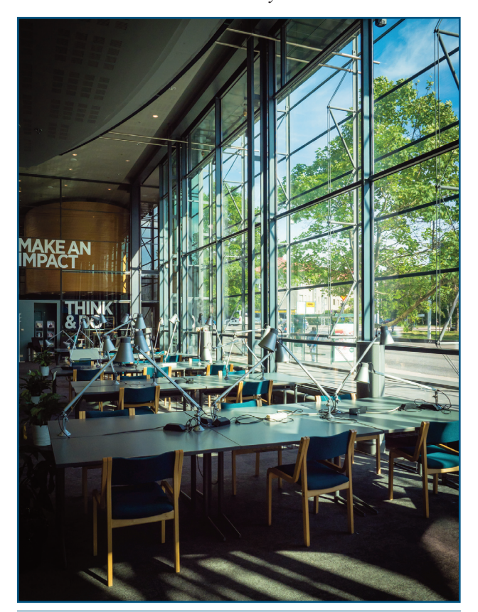
Fig.1. Terkko Health Hub is a startup community, a coworking area and an event space focused on health and life sciences. Through the Hub, the Meilahti Campus Library offers modern library services in the medical and health science fields, a learning environment and both printed and e-collections.

We found out that the students would need spaces for both reading in silence and for group working. They mentioned hammocks and cozy chairs.