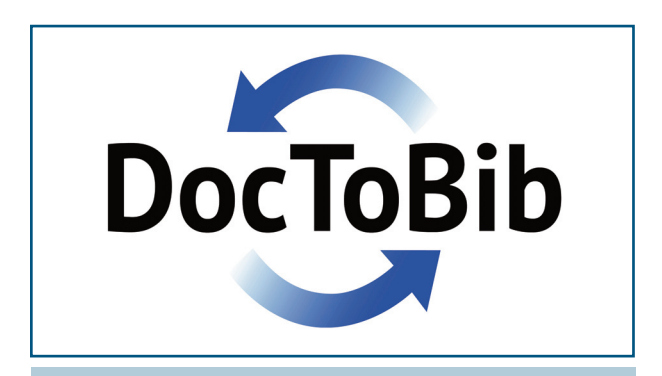
Fig. 3. DocToBib's logo

Although DocToBib can be a resource for those that do not have a librarian at hand, it can be useful to librarians themselves to complement their teaching. The videos have proven to be a useful learning tool: librarians have given feedback to the service, documenting their use of the tutorials through the "flipped classroom" method (7). They asked the students to watch the videos before a class on research training, in the comfort of their own home (or library), so they could grasp the fundamentals before a class on PubMed or Zotero. When comes the time to meet the teaching librarian, they were able to discuss their own difficulties that were not addressed in the video directly with the teacher so they could offer their guidance and expertise.