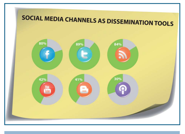
Table 1. Percentage of publishers utilizing socialmedia to disseminate their content.

Most of them prefer to use social media that are popular in society at large such as Facebook or Twitter: 89% of them have set up a Twitter account and 80% a Facebook page to promote and share their contents and to enhance their visibility and use ( Table 1 ).