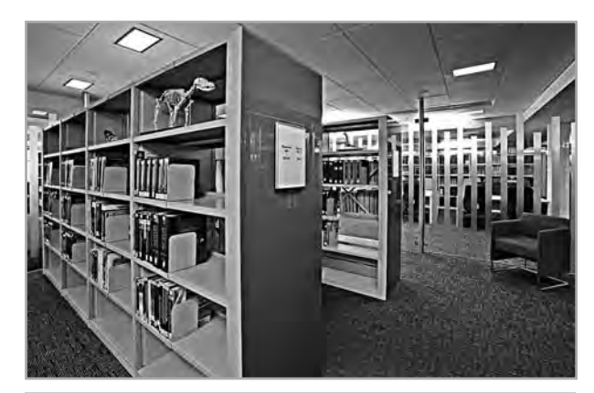
Fig. 1. LSoKVL from the Reserve area

The LSoKVL (Figure 1) has 97 study seats and five group study rooms, providing a further 50 seats. The helpdesk provides library and some IT support.