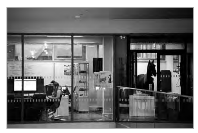
Fig. 3. The Study Landscape

library. The Library Annexe has an excellent scan and delivery service and to date all requests for material from the Library Annexe have been fulfilled the same day. The Library links to the Study Landscape allowing students access to a range of print and electronic resources combined with specimens, and veterinary and animal husbandry equipment.