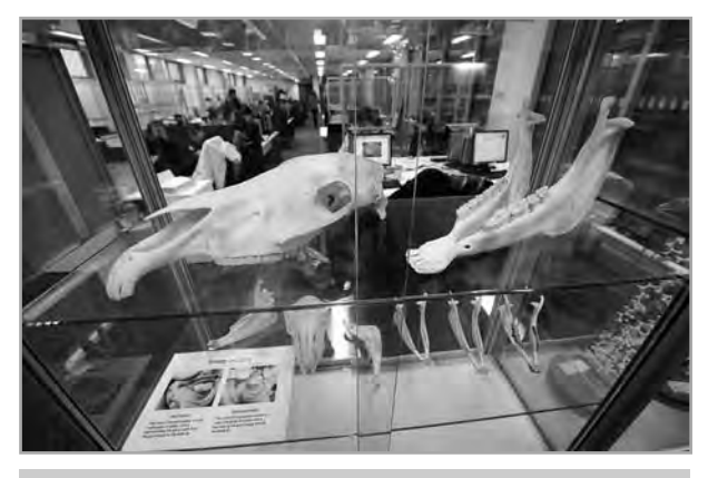
Fig. 2. The Study Landscape, taken from the door closest to the LSoKVL

With the move to the new facility the LSoKVL was asked to manage the lending of the School's sets of bone boxes. These are housed in the closed access specimen store in the LSoKVL and are issued from the helpdesk. The LSoKVL is staffed from 9am to 6pm, Monday to Friday, during semester. However, students can swipe in using their student cards and use the Library outwith these hours. The Veterinary Teaching Building is staffed from 8am to 10pm, seven days a week, during semester, and students can swipe into the building and use the Library and any of the other study spaces. There has been a reduction to the open access print collection and there is an e-preference mandate. With the move to the new site the LSoKVL moved around half of its collection into the off-site Library Annexe and this move has ensured maximum space for study seats in the new