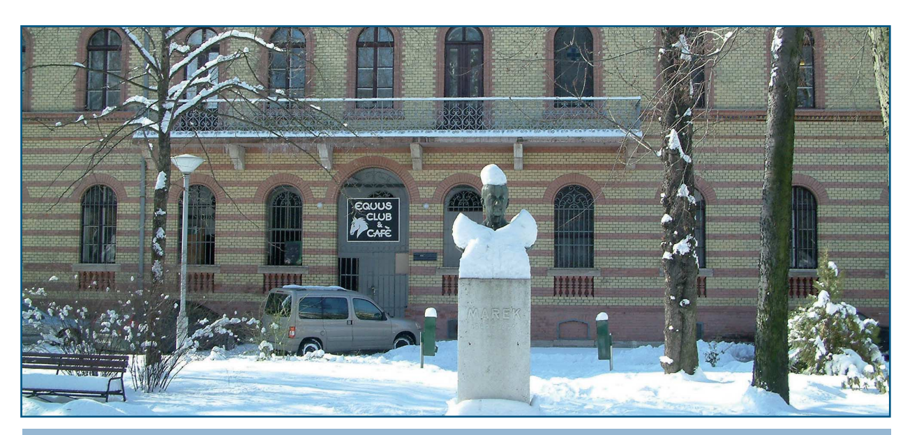
The picturesque veterinary campus with the library