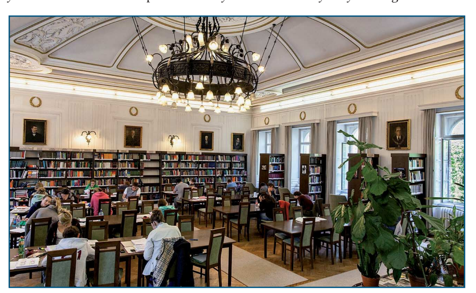
The reading room of the Veterinary Science Library, Archives and Museum

Please, take a note in your calendar: come to ICAHIS 9, 2017, Budapest, Hungary!