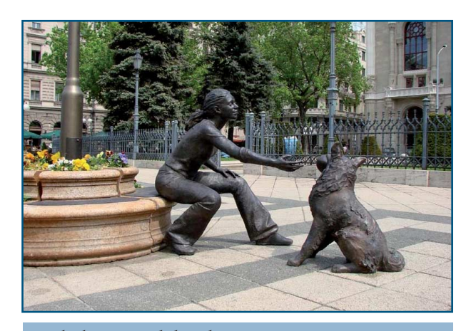
Girl playing with her dog